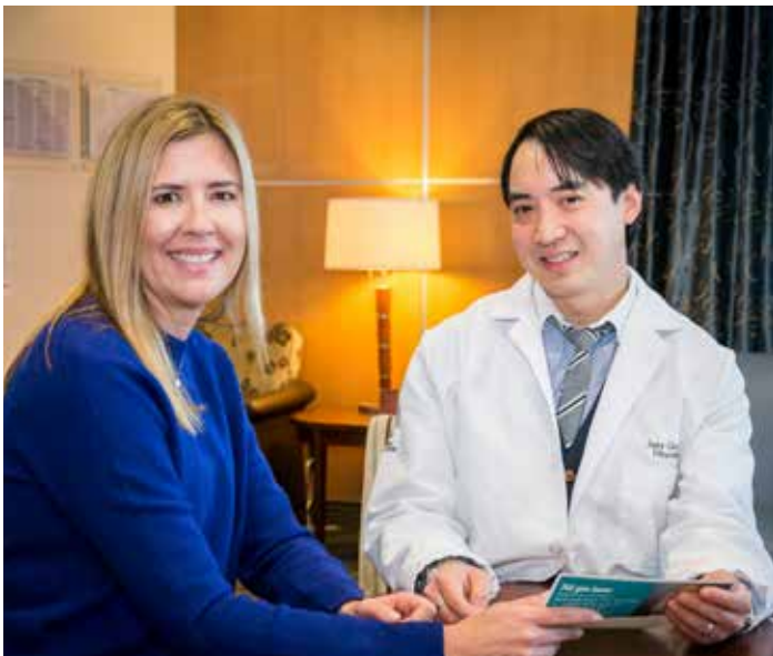
Mission Neuroscience Institute. "Each discipline comes together to provide the most extraordinary care which leads to optimal healing."